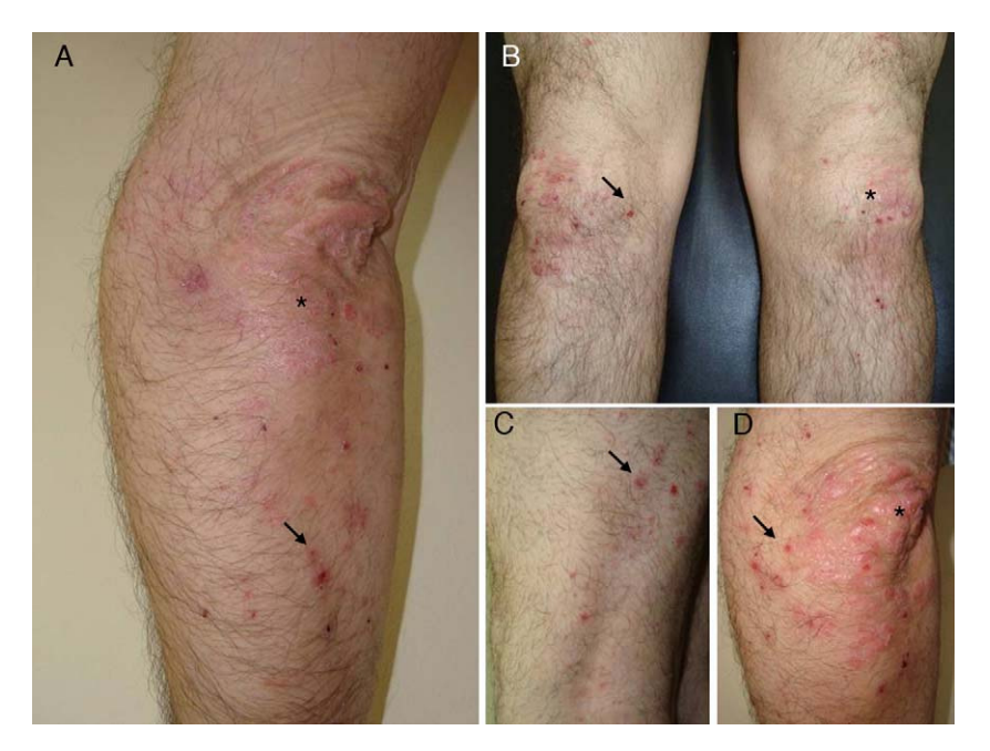
Figure 1 Psoriatic plaques (asterisks) and multiple excoriated vesicles (arrows). The lesions are spread over the extensor surfaces of the legs and arms. A, Right elbow. B, Knees. C, Detail of right knee. D, Detail of right elbow.

gluten-free diet, with no additional pharmacologic treatment, for 3 to 6 months.<sup>3</sup> The same patients experienced flare-ups when gluten was reintroduced to their diet. It is noteworthy that in the same study, there was no improvement in psoriasis in patients who followed the gluten-free diet but who did not have celiac disease-associated antibodies. Based on these observations,<sup>2</sup> several authors recommend screening for celiac disease in patients with psoriasis.<sup>4</sup> Psoriasis has also been associated with other IgA-mediated autoimmune diseases, namely, linear IgA pem-