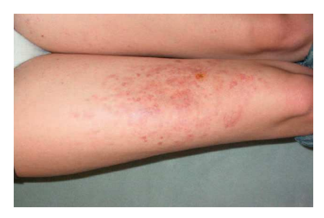
Figure 1 Shiny, erythematous papules on the medial surface of the right thigh.

We have found 13 cases of multiple clustered dermatofibromas described in the literature, the majority of which were reported in the review by Gershtenson.<sup>4</sup> There