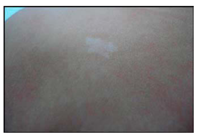
Figure 1 Lanceolate hypopigmented macule on the thigh.

medial half of the left upper eyelid and a hypopigmented macule at the medial angle of the eye (Figure 2), which were present at birth. The clinical suspicion of tuberous sclerosis led us to perform cerebral magnetic resonance imaging, which revealed multiple cortical tubers (Figure 3), and an