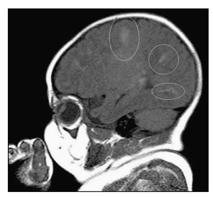
Figure 3 Sagittal magnetic resonance image of the brain showing multiple cortical tubers.

electroencephalogram, which revealed irritative foci. The other diagnostic tests, including fundus examination, were normal. The initiation of treatment with valproic acid and vigabatrin controlled the symptoms and was tolerated well by the patient. The study of the parents was negative.