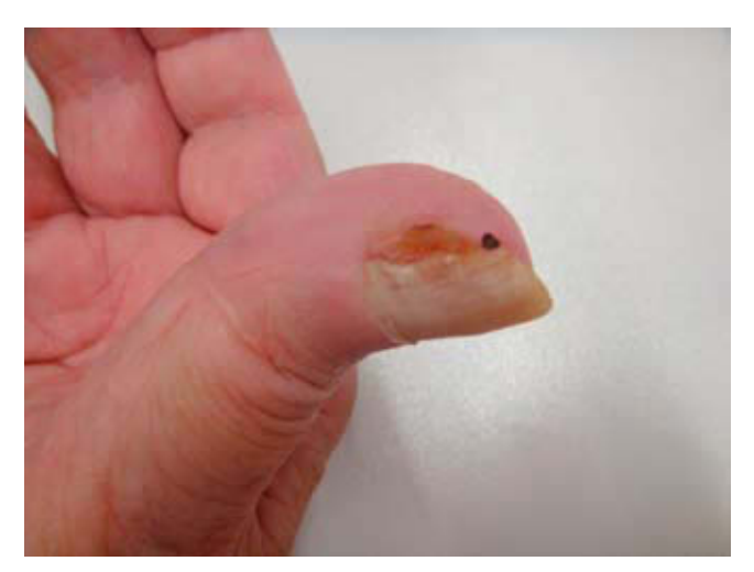
Figure 1 Excrescent lesion at the lateral border of the nail plate with minimal superficial erosion.