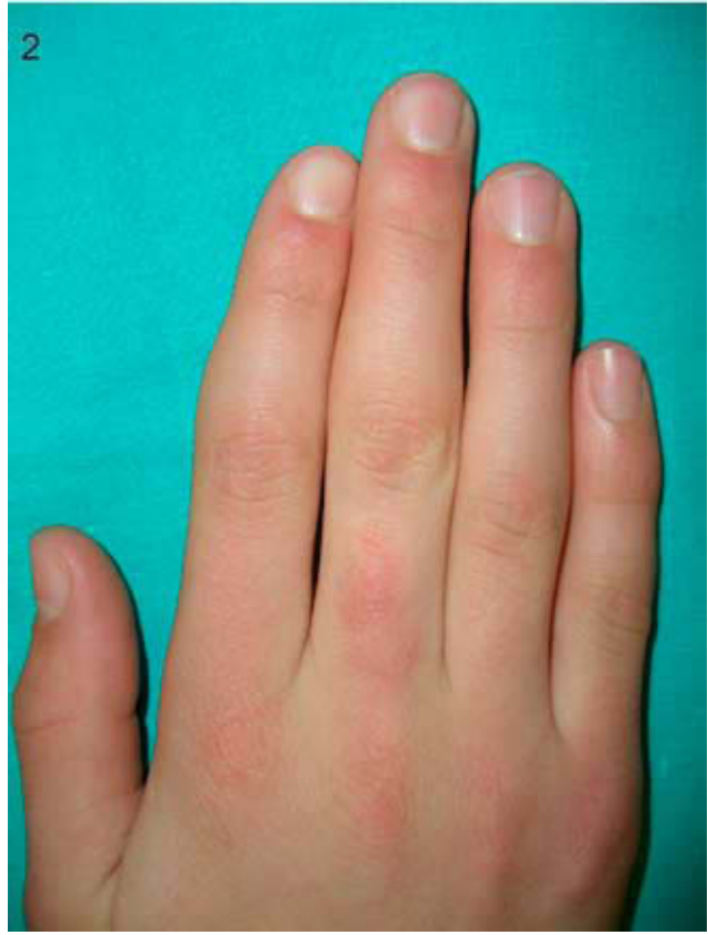
Figures 1 and 2 Swelling of the lateral aspect of the proximal interphalangeal joints of the second, third, and fourth fingers of each hand, more visible on the right hand (Figure 2).