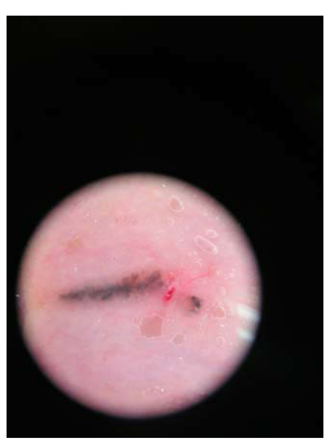
Figure 2 Dermoscopic aspect.

The lesion was removed by simple excision, with primary closure of the wound. The surgical margins were free of tumor cells (Figure 3B). Pigmentation was present in the tumor and in the stroma (Figure 3C). After 4 years of follow-up there has been no recurrence.