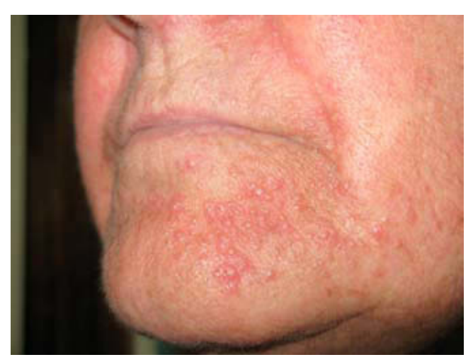
Figure 1 Patient with perioral erythematous papules and pustules. There are no comedones.

The patient was a 64-year-old woman with no family or personal past history of interest. She was seen in 2005 for asymptomatic facial lesions. On physical examination she presented erythematous papules of 1 mm in diameter in the perioral region, with no comedones or pustules (Figure 1). The initial suspicion was of perioral dermatitis and treatment was started with oral doxycycline (100 mg/12 h) for 3 months, with no improvement. A biopsy