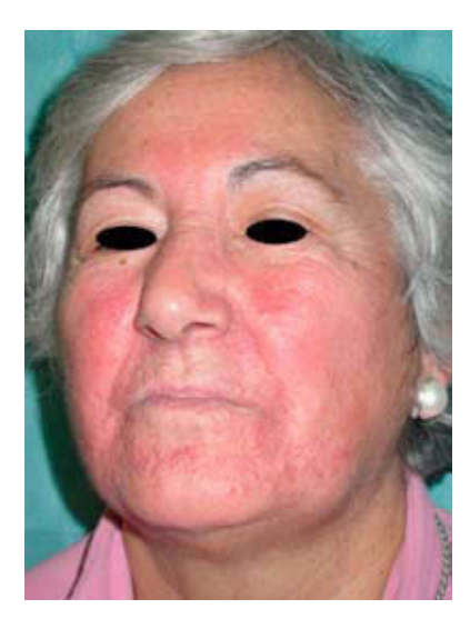
Figure 3 Frank deterioration with spread to the eyelids and cheeks.

Three years after the initial diagnosis, a further biopsy was performed, showing new epithelioid granulomas related to the hair follicles, some with central necrosis. The pathology report gave a diagnosis of granulomatous rosacea.