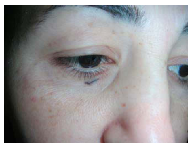
Figure 1 Linear pigmented lesion on the right lower eyelid.

On physical examination there was a linear pigmented lesion measuring 1.5 \times 0.4 cm. The lesions had a pearly border and central scarring (Figure 1).