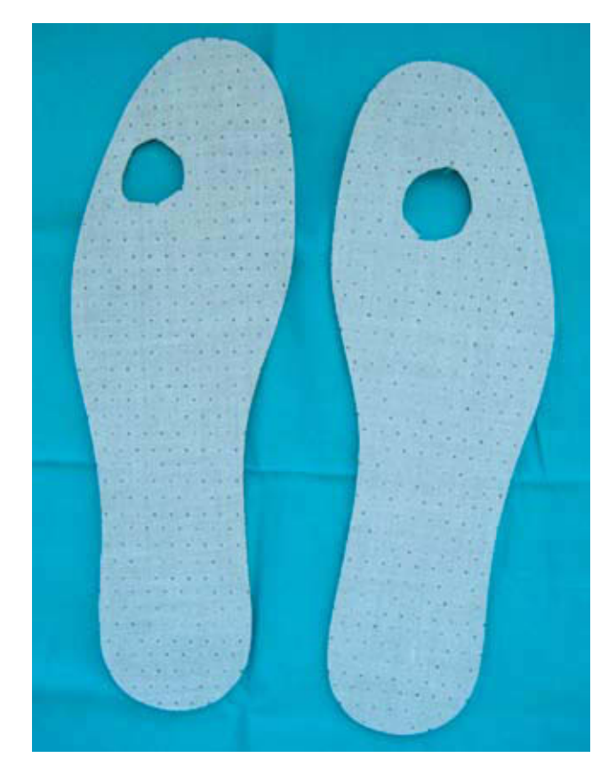
Figure 1 Insoles with circular cutouts that avoid pressure on a plantar wart.

Plantar warts are caused by cutaneous human papillomavirus.<sup>1</sup> The condition is a very common reason for visits to a dermatologist,<sup>2-4</sup> and, although the warts are totally benign, they are accompanied by significant morbidity, as standing and walking typically cause pain and discomfort.<sup>5,6</sup>