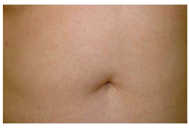
Figure 1 Patient 1: Typical lichen nitidus lesions (small fleshy papules on the abdomen) before treatment.

In the case of LN treatment with ultraviolet radiation, there are isolated case reports of a favorable response to oral psoralen-UV-A (PUVA),<sup>3</sup> UV-B/UV-A phototherapy associated with low-dose corticosteroids,<sup>10</sup> and intense exposure to solar UV radiation.<sup>2</sup>