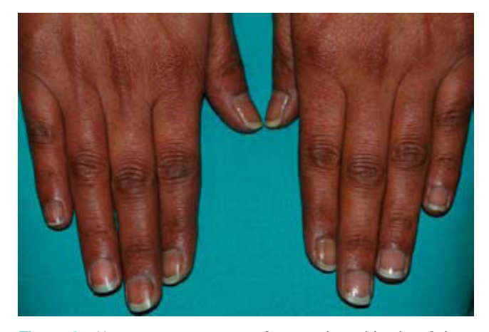
Figure 3 Hyperpigmentation on fingernails and backs of the hands.