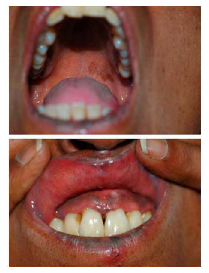
Figure 2 Hyperpigmented macule in palatal mucosa. Mucosal hyperpigmentation.

Histology of an excisional biopsy from the abdominal area showed prominent basal hyperpigmentation and presence of abundant dermal melanophages (Figure 4).