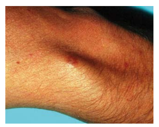
Figure 1. Brownish tumor, 1 cm in diameter, situated on the left elbow.