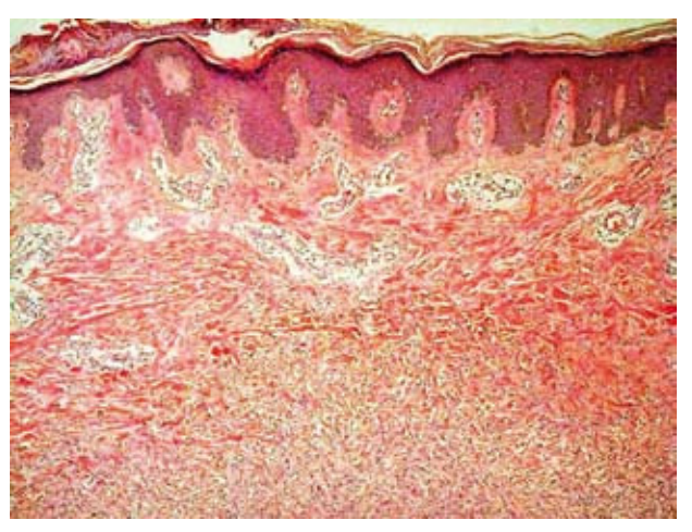
Figure 2. Histiocytes and abundant fibroblasts between thick bundles of collagen in the middle and deep dermis, respecting a thin superficial layer (hematoxylin-eosin, ×100).

The patient also presented a lipodystrophic phenotype, with central adiposity and lipoatrophy of the face and limbs. There were no cutaneous manifestations of hyperlipoproteinemia.