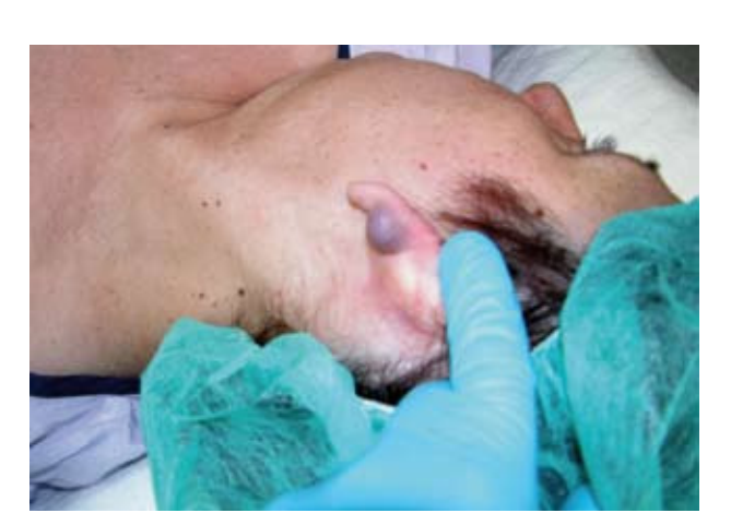
Figure 1. Patient 1. Violaceous nodule with a diameter of 1.5 cm in a 58-year-old woman.

In the first patient, the clinical diagnosis was an angioma of unspecified type and in the second, angiomyolipoma, given the similarity with the previous case.