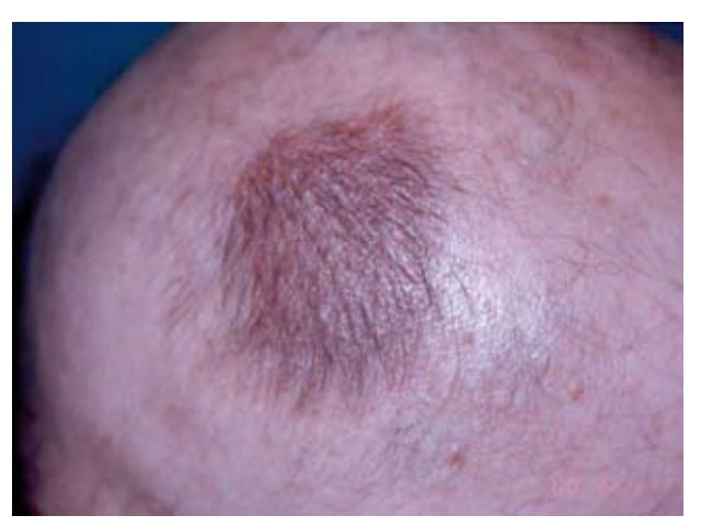
Figure 1. Regrowth in an alopecic area treated by infiltration of triamcinolone acetonide.

In short, the technique consists of sensitizing the patient with a laboratory allergen that is not normally found in the environment. Once obtained, the substance is applied to the affected area. A delayed eczematous reaction will