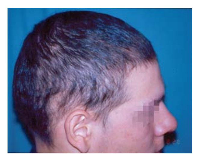
Figure 3. Outcome after 6 months' treatment with 500 mg/d of intravenous methylprednisolone for 3 consecutive days a month. Regrowth can be observed on almost 90% of the scalp.