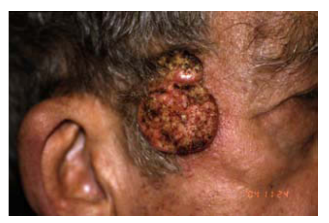
Figure 3. Case 2: clinical appearance of the verrucous carcinoma.

We thank Drs Luis Requena and Evaristo Sánchez Yus for their valuable collaboration in the review of the histological samples in Case 1.