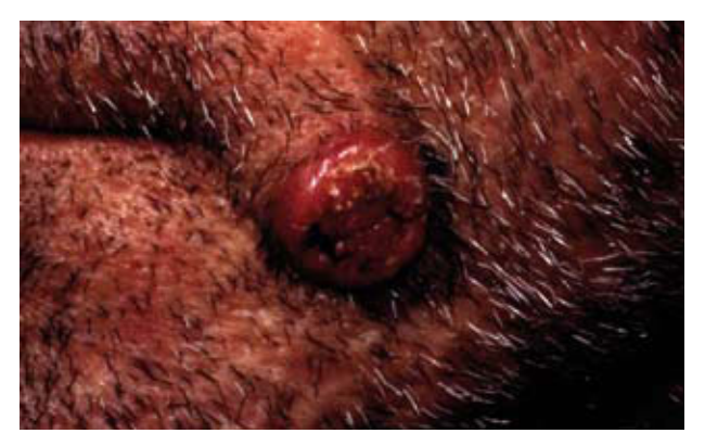
Figure 1. Case 1: verrucous, crateriform tumor, close to the left oral commissure.

Case 1 was a 45-year-old man with no relevant medical or surgical history, who consulted in 1996 because of an