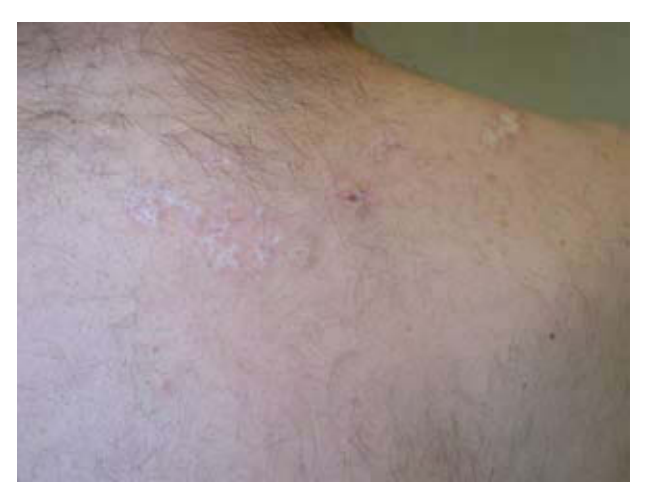
Figure 1. Whitish plaques with atrophic surface and violaceous erythematous edges in a linear blaschkoid distribution on the upper right side of the back.