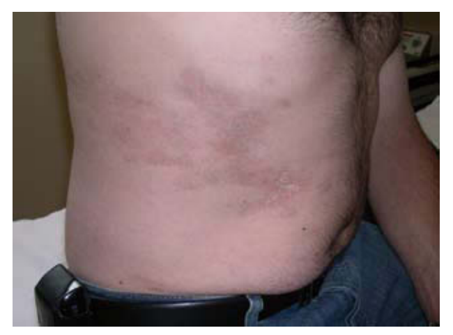
Figure 2. Shiny whitish plaques on underlying scarring with postinflammatory hyperpigmentation in dermatomes D9-D10.

Hypopigmented and indurate plaques were also present on the right-hand side on a depressed area with postinflammatory hyperpigmentation in dermatomes D9-D10—an area where the patient had suffered an episode of herpes zoster 7 years previously (Figure 2). Histopathology of a biopsy extracted from the lesions on the shoulder showed thinning of the epidermis with the loss of the epidermal crests, marked edema in the papillary dermis, more homogenous collagen, and a lymphocytic infiltrate in the middle dermis (Figure 3). Once a diagnosis of lichen sclerosus et atrophicus was confirmed by histopathology, topical treatment with clobetasol propionate 0.05% was prescribed, with a moderate improvement seen in the lesions after a month of treatment.