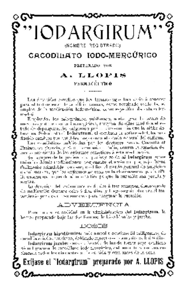
Figure 3. There is very little advertising in the first issues of Actas, but it is present; in this case, an advertisement for a derivative of iodomercury for use in the treatment of syphilis. Mercury-based treatment in dermatology and venereology was swept almost completely out of the picture by arsenic-based treatments after 1909, when Ehrlich and Hata presented salvarsan, or "number 606." The beginning of the end of syphilis, however, did not come until 1944, with the widespread use of penicillin.

remember these presentations well, since they continued in this fashion until a few decades ago.