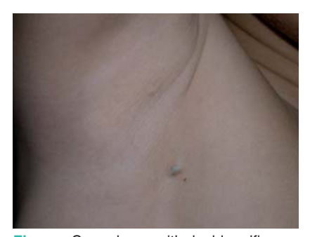
Figure. Comedones with double orifice, with a cystic lesion.

Since this entity was first defined, we have seen 3 patients with lesions