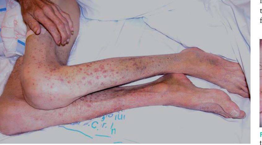
Figure 1. Note the large violaceous lesions, follicular hyperkeratosis, and coiled hairs observed in our patient.

violaceous cutaneous lesions on the legs and abdomen (Figure 1). His personal history included several episodes of hemarthrosis and flare-ups of hematuria in the previous 2 years that had not been specifically diagnosed. Dermatoscopy of the cutaneous lesions revealed a pale orange perifollicular halo surrounded by peripheral hemorrhagic another violaceous halo, along with "corkscrew" hair and follicular hyperkeratosis (Figure 2). A skin biopsy showed a ringlet-like hair shaft sectioned at different levels inside the follicle, compact perifollicular fibrosis, and extravasated erythrocytes in the dermis, but not in the perifollicular fibrotic area mentioned above (Figure 3).