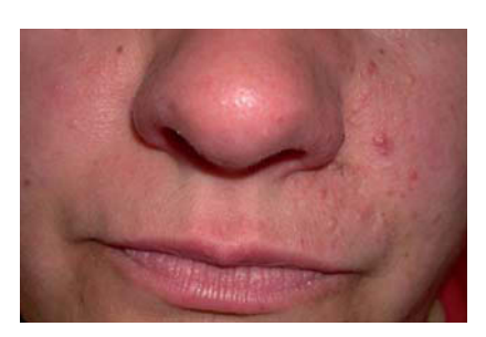
Figure 1. Multiple small dome-shaped papules located in the left nasolabial crease, without crossing the midline.

with angiomatous hyperplasia (Figure 2). All imaging tests performed by the neurology department were carefully reviewed and, because the physical examination was strictly normal, no other additional tests were requested. We recommended carbon dioxide laser treatment, which was refused by the patient; she is currently attending periodic follow-up visits.