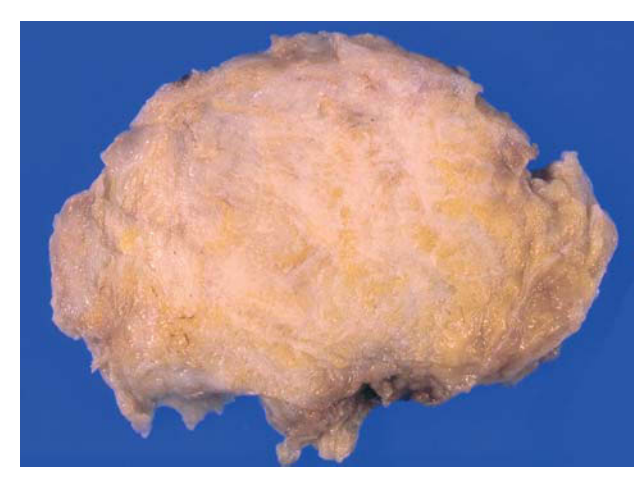
Figure 3. Elastofibroma. Poorly delimited tumor of a firm consistency, whitish-grey when cut with yellow zones and fibroadipose aspect.