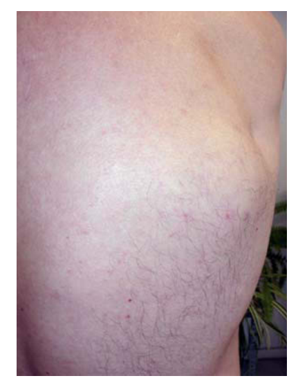
Figure 1. Right subscapular mass that becomes more evident when moving the arms forward.

In the computerized tomography scan, the lesions were found on the inferior border of the scapula adjacent to the thoracic wall, with areas isodense with skeletal muscle and hypodense laminar areas with no remodeling of the adjacent bone (Figure 2). X-ray examination revealed bilateral involvement in 3 cases.