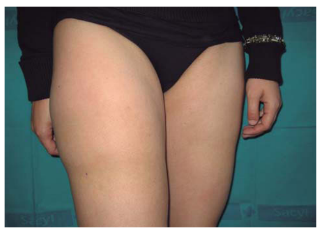
Figure 1. Horizontal depressions in the form of bands on the anterolateral aspect of the thighs. These are more noticeable on the right thigh.

In 2006, electromagnetic lipolysis of fatty tissue was put forward as a hypothesis.<sup>6</sup> It was suggested that the electromagnetic fields generated by computer equipment and cables would lead to alterations in the intrinsic bioelectric properties of the skin and activate macrophages with lipophagic activity in the hypodermis. Electrical stimulation could also damage adipocytes directly. Similarly, air