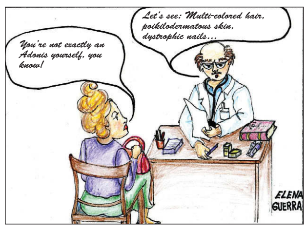
Figure 1. In the Doctor's surgery