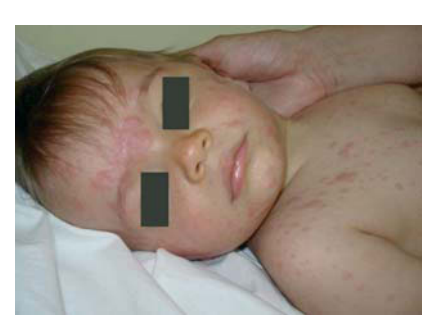
Figure 1. Initial facial lesions.

and retroauricular area) (Figure 1), and rapidly spread to the trunk and limbs (Figure 2). According to the mother, some days earlier, he had presented a large plaque on the scalp that had disappeared spontaneously in a few days, without leaving any sequelae. In addition, there were enlarged laterocervical and inguinal lymph nodes, measuring 1 cm, in the surrounding area, but no constitutional symptoms.