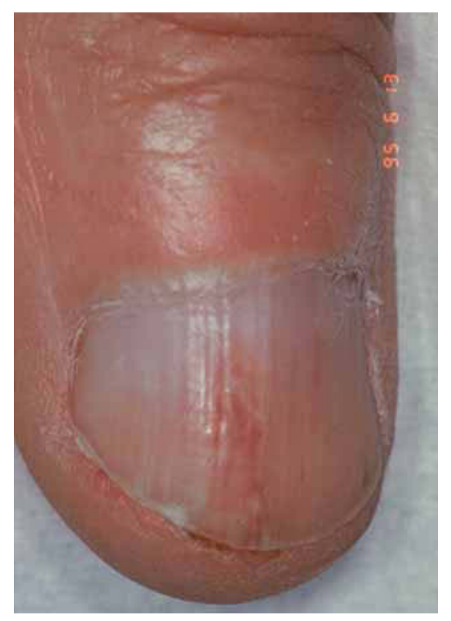
Figure 8. Longitudinal erythronychia showing Bowen's disease after subungual biopsy.