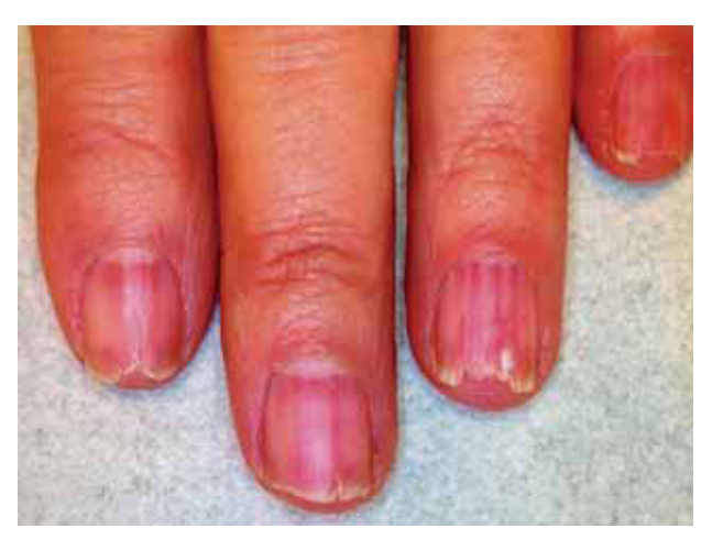
Figure 10. Polydactylous longitudinal erythronychia of the fingers (Courtesy of Krayenbühl B. Switzerland).

The number of abnormal nails ranges from two or three to all nails in a minority of patients. Toenails are involved but less often and less severely than fingernails<sup>21</sup>. The nail lesions (54 out of 56 patients) and palmar pitting (49 out of 56 patients) are earlier and more consistent evidence of the presence of the gene than is the characteristic rash<sup>25</sup>.