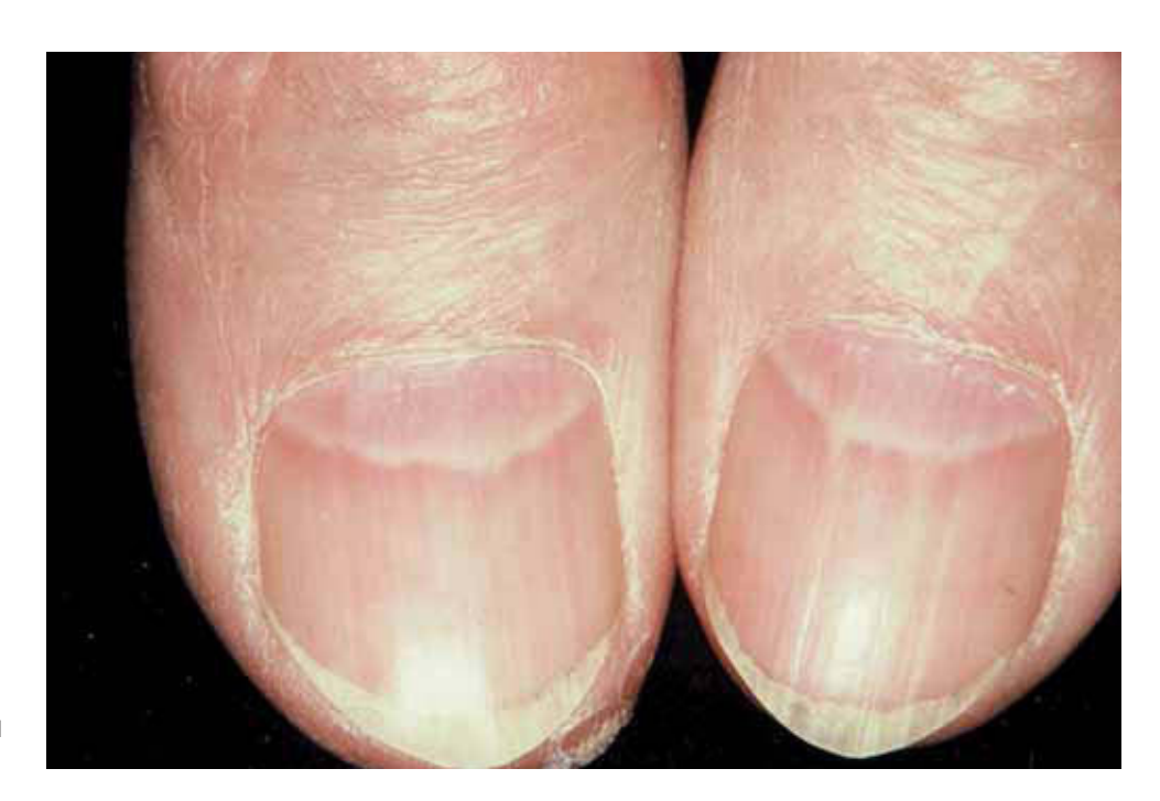
Figure 1. Red lunula separated from the pink nail bed by a whitish crescent.

with several cutaneous or systemic disorders and, based on the etiology, have been divided by Philippe Cohen<sup>1</sup> into cardiovascular<sup>2-5</sup> (fig. 1), cutaneous<sup>4,6-10</sup> (fig. 2), endocrine<sup>3,4</sup>, gastrointestinal<sup>4</sup>, hematologic<sup>4</sup>, hepatic<sup>3,4</sup>, infectious<sup>2-4</sup>, miscellaneous<sup>3-6,8,9</sup>, neoplastic<sup>2,3</sup>, neurologic<sup>4</sup>, pulmonary<sup>3,4</sup>, renal<sup>4</sup> and rheumatologic<sup>4,5,11</sup>.