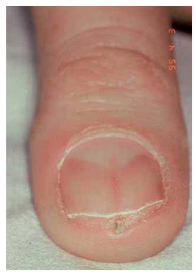
Figure 7. Onychopapilloma: keratinized expansion after removal of the distal nail plate.

3. The polydactylous type has never been clearly associated with malignancy in contrast to some cases presenting with single longitudinal erythronychia <sup>17-19</sup>. Nevertheless the case report of a patient with longitudinal streaky pink erythronychia of the thumb revealing a melanoma in situ and one dark red longitudinal line of a finger of the same hand <sup>19</sup> indicates that the relationship between idiopathic polydactylous longitudinal erythronychia and idiopathic single or double monodactylous longitudinal erythronychia banding still remains uncertain.