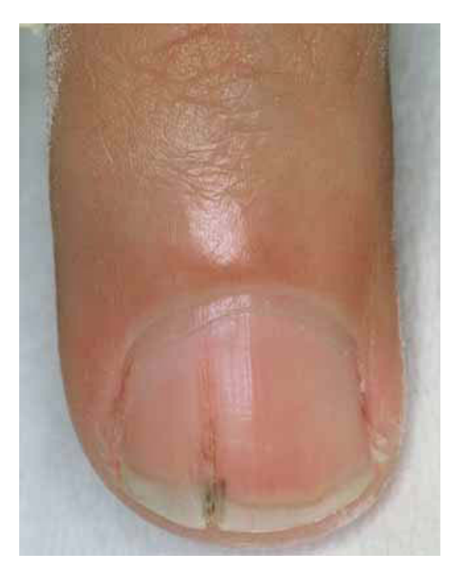
Figure 4. Isolated longitudinal erythronychia with distal black end.

Most of the patients showed a common histological pattern. There was acanthosis of the epithelium of the nail bed with a slight extension to the lunula and a