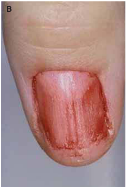
Figure 3. A. Isolated longitudinal erythronychia. B. Same patient showing the keratinized ridge involving the end of the lunula and the nail bed.