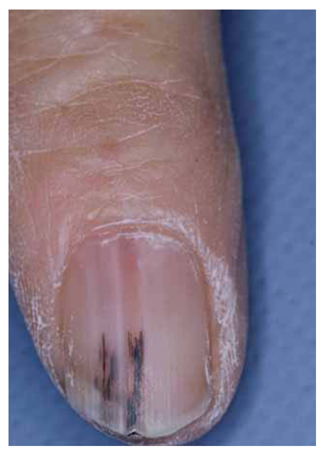
Figure 6. Double banding made of proximal erythronychia and distal haemorrhages.

erythronychia with some streaks running the whole length of the nail and finishing on a distal subungual keratosis with a tendency to fissuring at the free edge. Pain was experienced by this patient, a concert pianist, and when he was playing it became progressively worse. In some other cases this symptom was not confirmed.