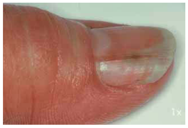
Figure 9. Longitudinal erythronychia with distal onycholysis presenting with Bowen's disease after biopsy of the nail bed.

The number of abnormal nails ranges from two or three to all nails in a minority of patients. Toenails are involved but less often and less severely than fingernails<sup>21</sup>. The nail lesions (54 out of 56 patients) and palmar pitting (49 out of 56 patients) are earlier and more consistent evidence of the presence of the gene than is the characteristic rash<sup>25</sup>.